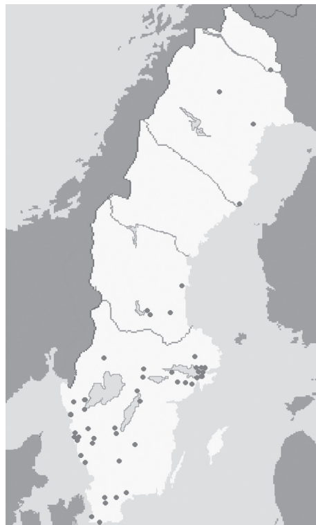
Figure 1. Randomly chosen school

The selection of children was based on randomly chosen schools and classes from the whole of Sweden. In the study 48 randomly chosen schools and nearly 2000 pupils from school year 3, 6 and 9 participated (figure 1). The study included background data such as socio-economic status, geographical and environmental factors.